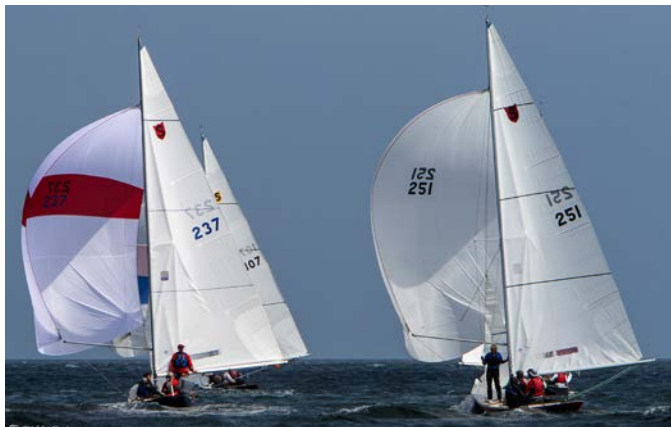
The Shields Class Foundation was created to introduce new sailors to the class, and to introduce the class to new sailors.

The Foundation will sponsor informational seminars on relevant topics as well as coordinate and assist with on-the-water instructional clinics. Consistent with its initiative to introduce new sailors to the class, it hopes to introduce the class to new sailors with a special focus on youth sailors at the club, college